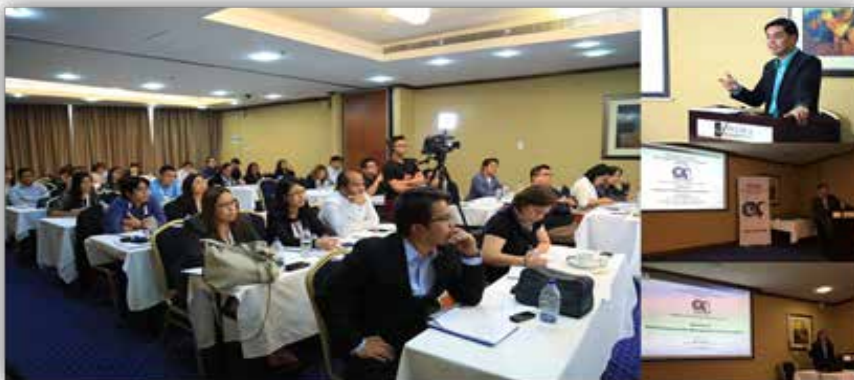
PICQS UAE Chapter Trainees and Trainers during one of the GaMP Training sessions.