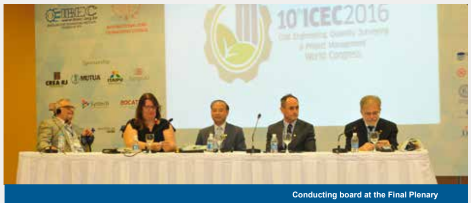
Conducting board at the Final Plenary