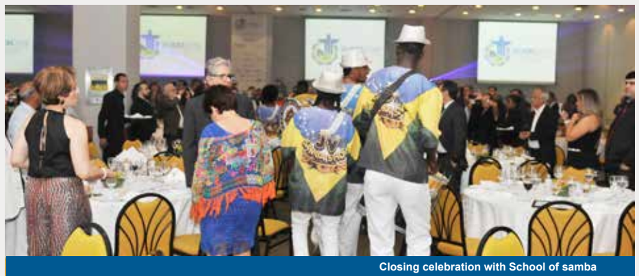
Closing celebration with School of samba