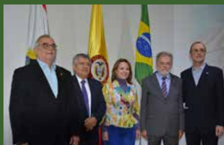
Sustainability and Project Management Seminar in Colombia