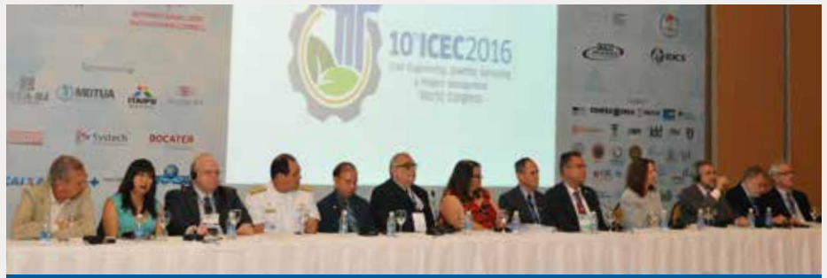
Opening plenary at the Congress

At the exhibition area the visitors could get in touch with exhibitors from the Brazilian Navy, FUNASA-Fundação Nacional de Saúde, AIQS-Australian Institute of Quantity Surveyors, who is organizing the 11th ICEC World Congress of 2018 in Sydney-Australia, as well as Itaipu Binacional, IBEC (the Brazilian Institute of Cost engi-