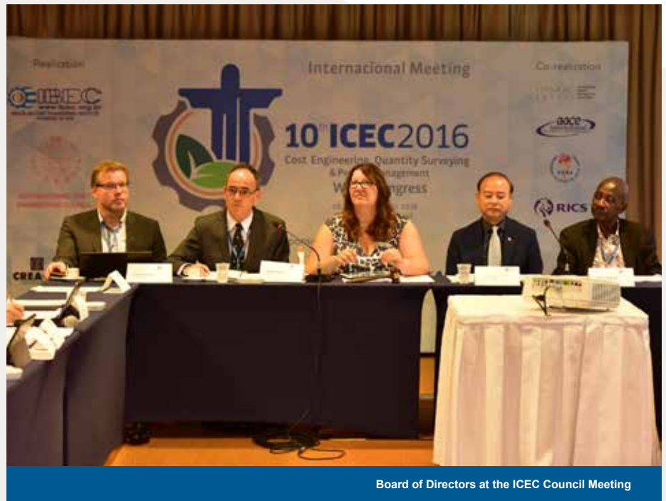
Board of Directors at the ICEC Council Meeting

The ICEC Council Meeting happened on October 08th and 09th and preceded the 10th ICEC 2016 World congress – Cost Engineering, Quantity Surveying and Project Management. One of the more significant results was the creation of new guidelines regarding ICEC's official website ( icoste.org ) for promoting and improving communication between professionals from all countries: standardizing scientific terminology – idioms and expressions and technical jargons etc – and developing and promoting a broader, more wide-ranging translated media in order to facilitate the interchange of techniques and experiences, once Region 1 has English-, Spanish-, Portuguese- and even French-speaking countries.