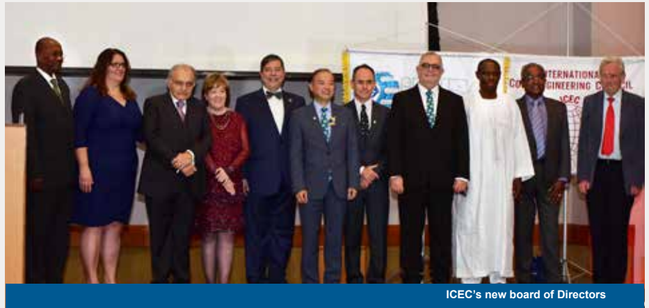
ICEC's new board of Directors