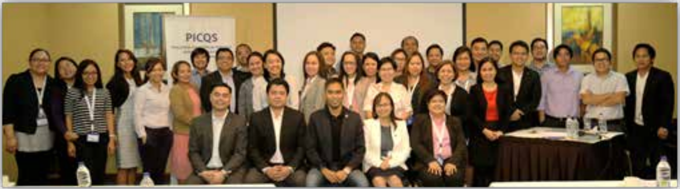
Oct. 21, 2016, the PICQS UAE Chapter Members posed for a group photo during the last training